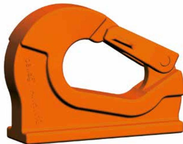
AWHW Weld-on hook

The product is manufactured according to EN 1677-1 with a higher load capacity. Attention should be paid to the delivered operating manual and to the welding instructions. A CE-marking further emphasises the superior quality of this product. Replacing the SFGW-A safety catch set is easy and quick, without the need for special tools.